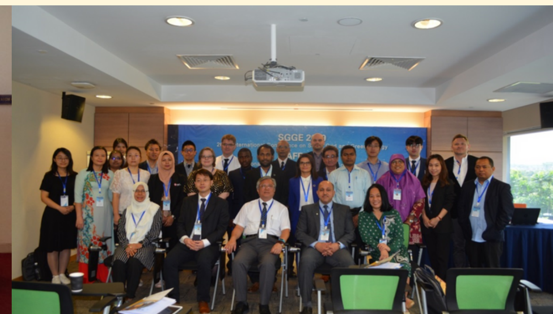
Singapore January 23-25, 2019