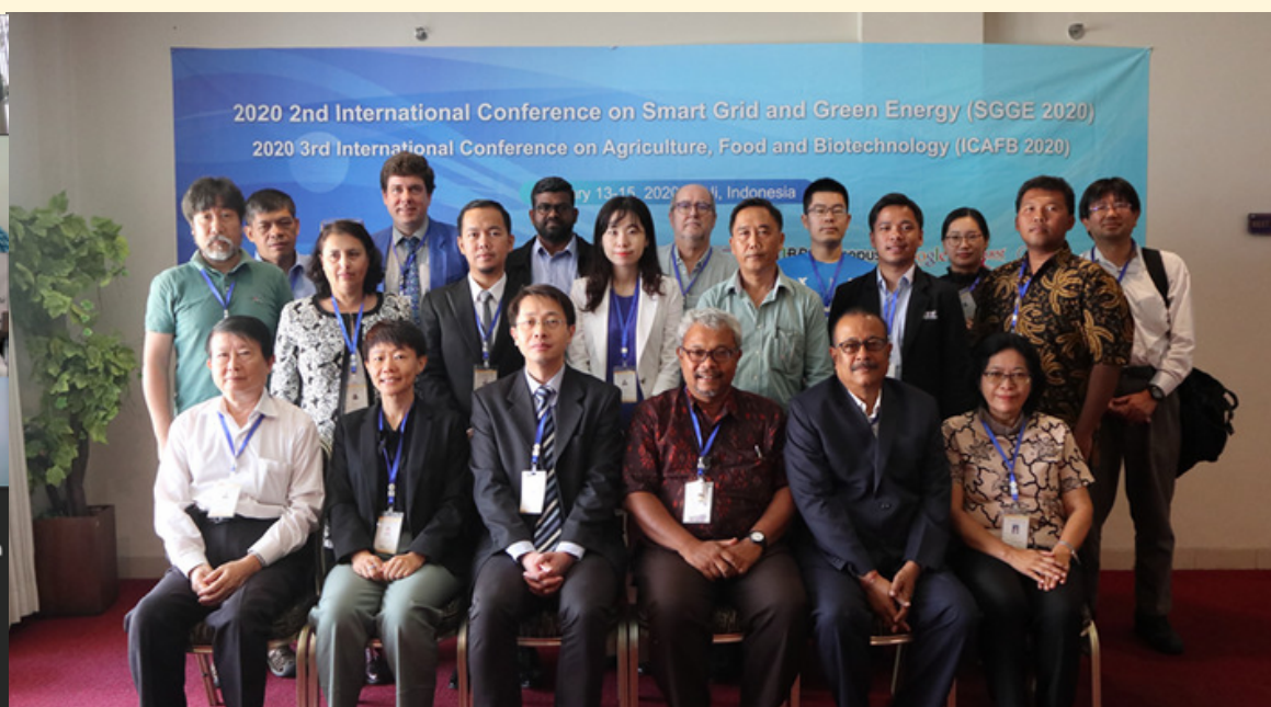
Bali, Indonesia January 13-15, 2020